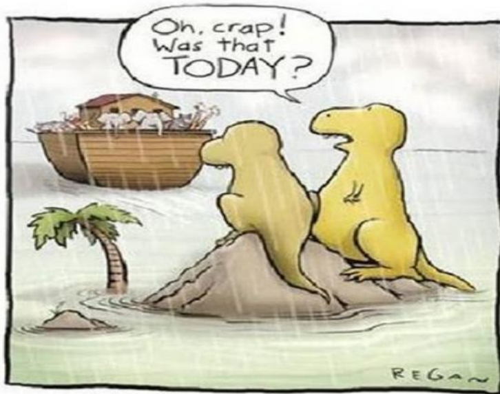
The first senior moment.