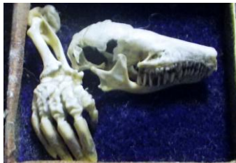
Mole Skull and Hand