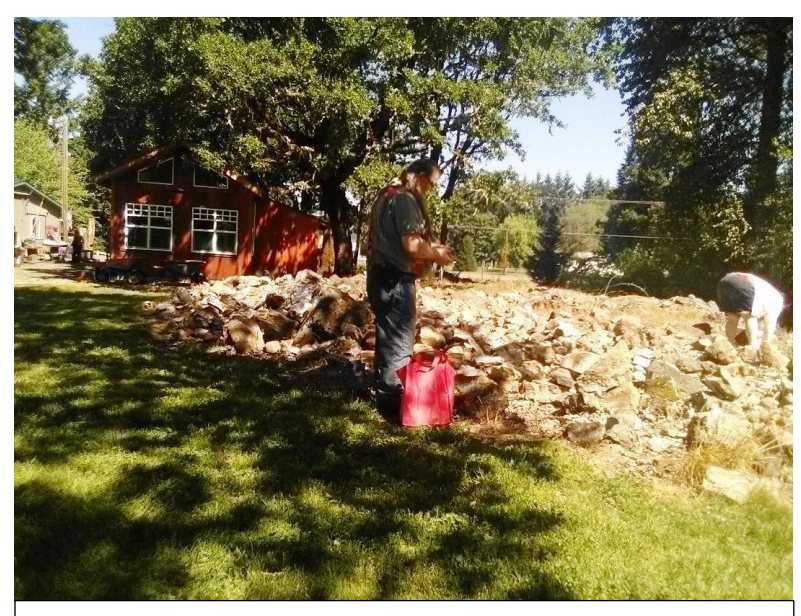
Wes getting ready to dive in to El Grande. Tammy already in.