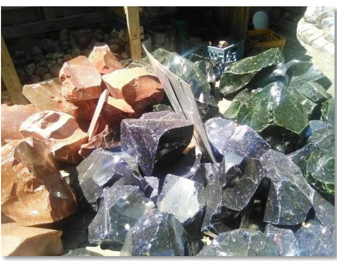
Goldstone- $10.00 a pound