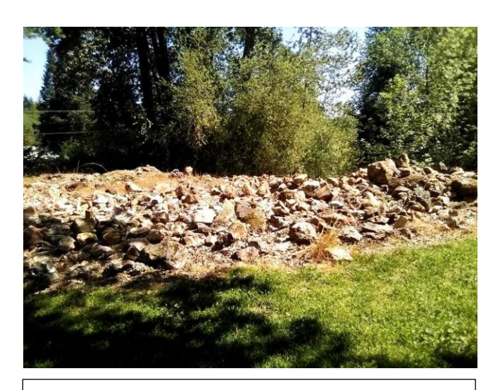
ROCK PILE "EL GRANDE"!