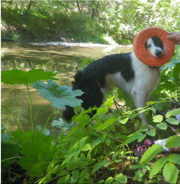
lo ran all the way back to camp & came back with his frisbee! Important stuff!