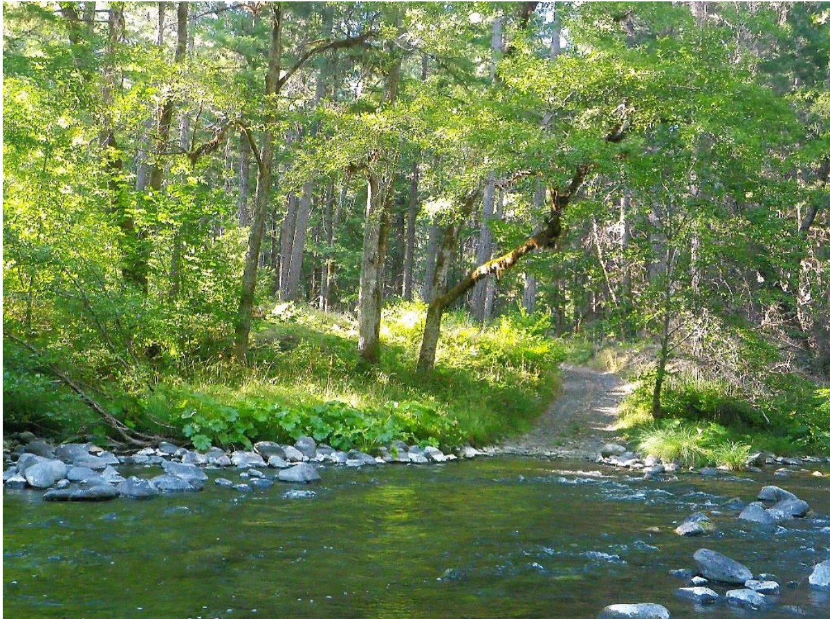
Brigg's Creek crossing to DT's #1 claim. Water was a bit too deep for us to drive across. We waded across.