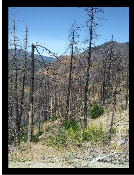
Some of the burned area looking down towards Soldier Creek