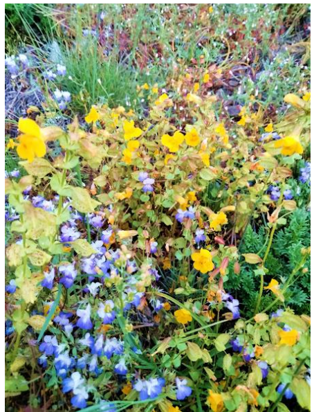
On way to Briggs and Briggs Creek at Fossil Flats